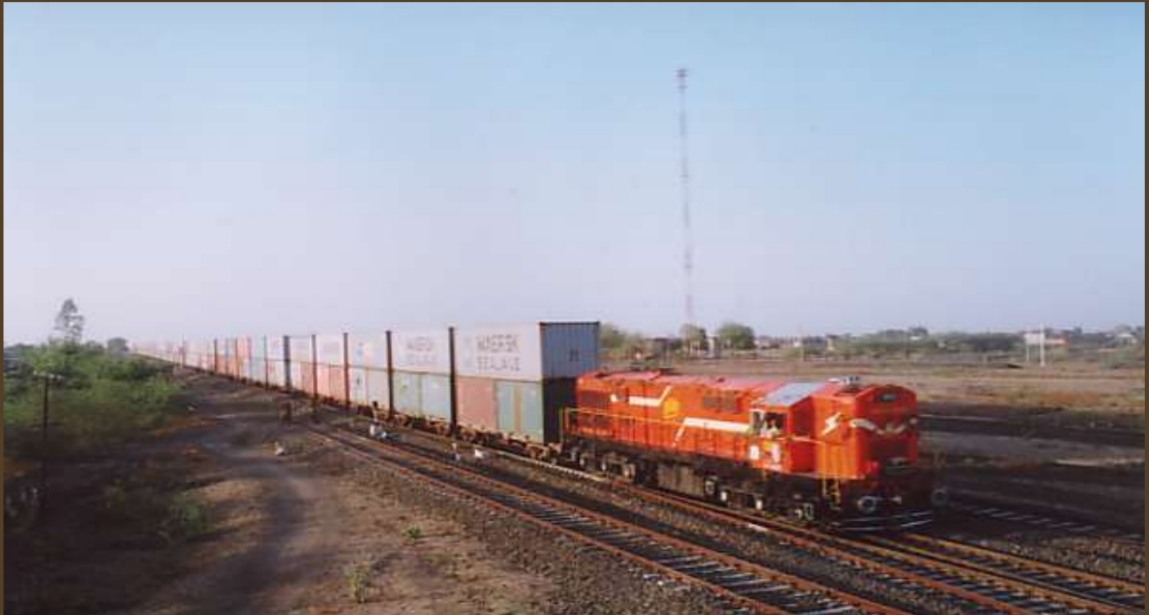
Dubble Stack Train Entering Botad Yard